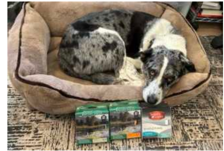
Tucker, deciding on which fly line to use.

The SLFF May 9, 2024 club meeting raffle will feature new, and perhaps ten year old, fly lines.