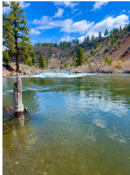
Truckee River In April